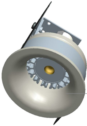
Trumpet-shaped optical compartment with soft lines

80mm deep recessed downlight Mounting method : recessed ceiling mounted Material : die cast aluminium housing Standard finishes : matt white / matt black IP Rating : IP20 / IP44 Accessories : clear glass / frosted glass / honeycomb louvre Customized RAL upon request. Dimmable driver available upon request. Emergency kit available upon request.